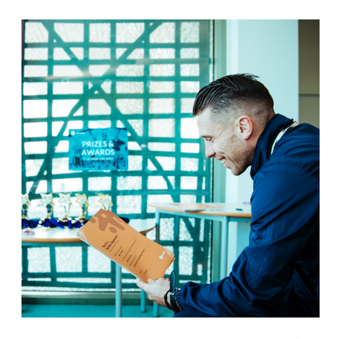
Our Top Tips For Successful Franchising

Buying into a franchise isn't a decision to be taken lightly, as it's so much more than just getting a new job.