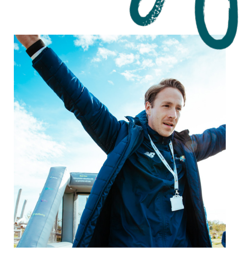
5 Reasons to Become a Franchisee

Find out more about the benefits of becoming a franchisee with our top five reasons: